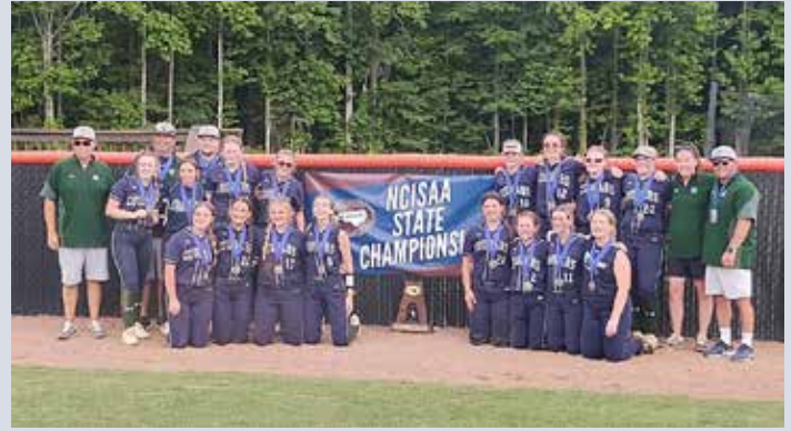
NCISAA 3A STATE CHAMPIONS SOFTBALL