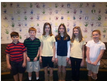
6th grade team