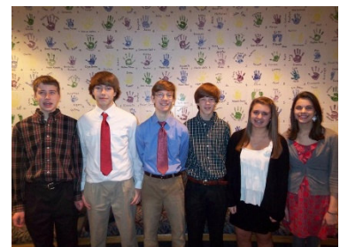
8th grade team