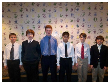
7th grade team